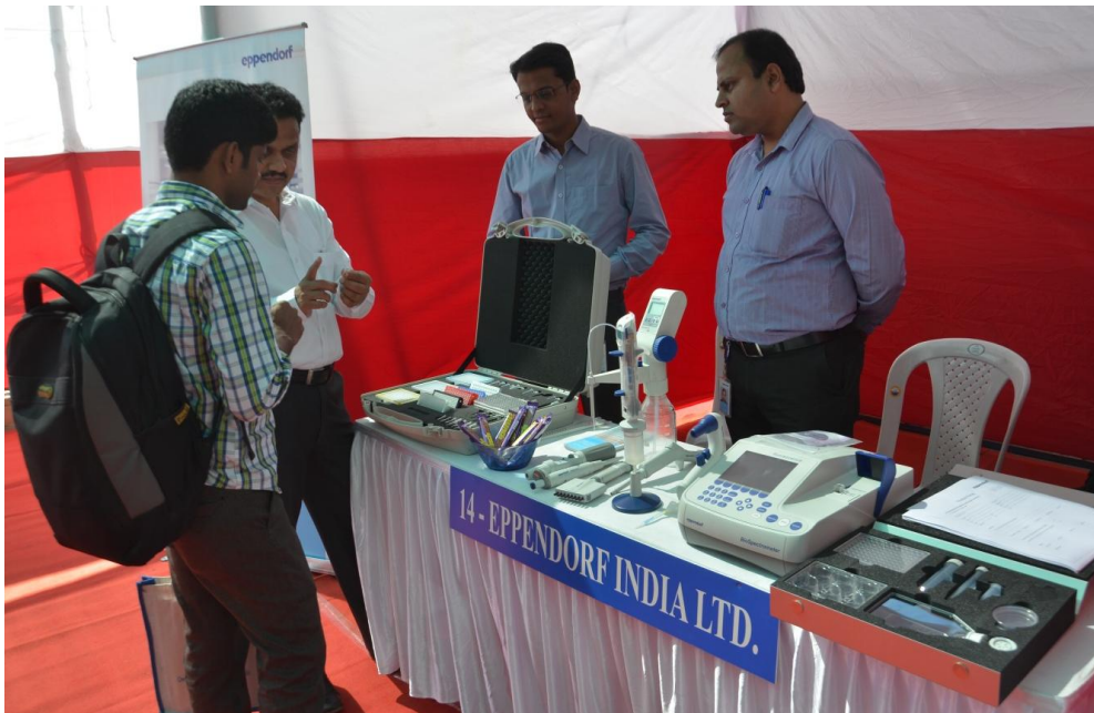
Participants at a company stall

The industry was represented by over 20 companies from various countries. Participants could also visit stalls set up by these companies to find out about the newest range of scientific products.