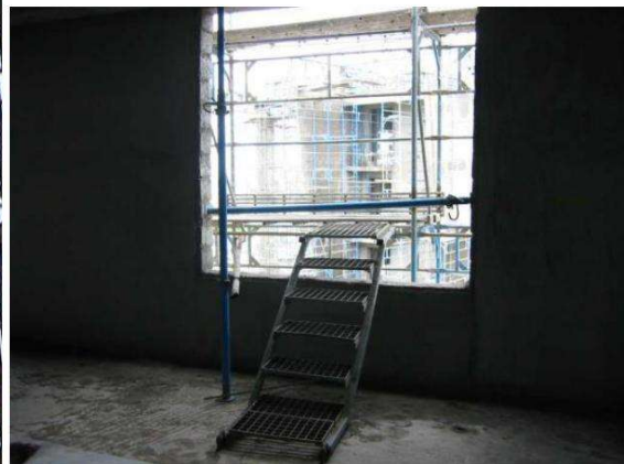
Proper Access to workplatform

All persons working on suspended scaffolds/cradles/gondolas must wear and use appropriate fall prevention equipment so as to protect them effectively at all times when they are at risk from any failure of any part of the scaffold/cradle/gondola, including its suspension system.