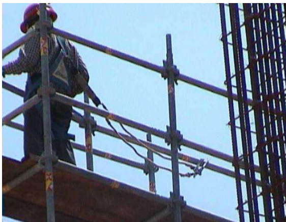
Full body harness with double lanyard

Guardrails are to be provided at all working places and other locations where persons or materials could fall more than 2.0m / 6'6". Where this can physically not be achieved, suitable and sufficient fall protection devices that do not rely on individuals should be provided and used to establish a safe place of work. (Examples include Safety Nets closely installed under height works, Stretched wire ropes installed to hook up safety harnesses while workers move from one location to another at height, Use of full body safety harnesses with double lanyards etc.)