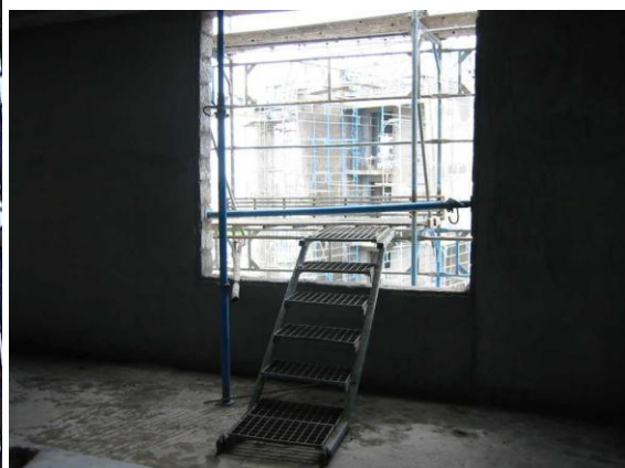
Proper Access to workplatform

All persons working on suspended scaffolds/cradles/gondolas must wear and use appropriate fall prevention equipment so as to protect them effectively at all times when they are at risk from any failure of any part of the scaffold/cradle/gondola, including its suspension system.