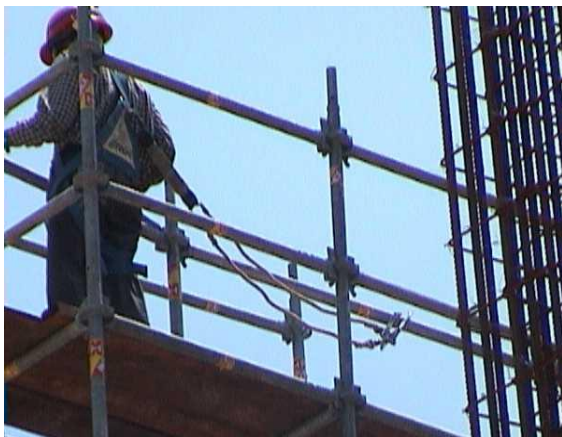
Full body harness with double lanyard

Guardrails are to be provided at all working places and other locations where persons or materials could fall more than 2.0m / 6'6". Where this can physically not be achieved, suitable and sufficient fall protection devices that do not rely on individuals should be provided and used to establish a safe place of work. (Examples include Safety Nets closely installed under height works, Stretched wire ropes installed to hook up safety harnesses while workers move from one location to another at height, Use of full body safety harnesses with double lanyards etc.)